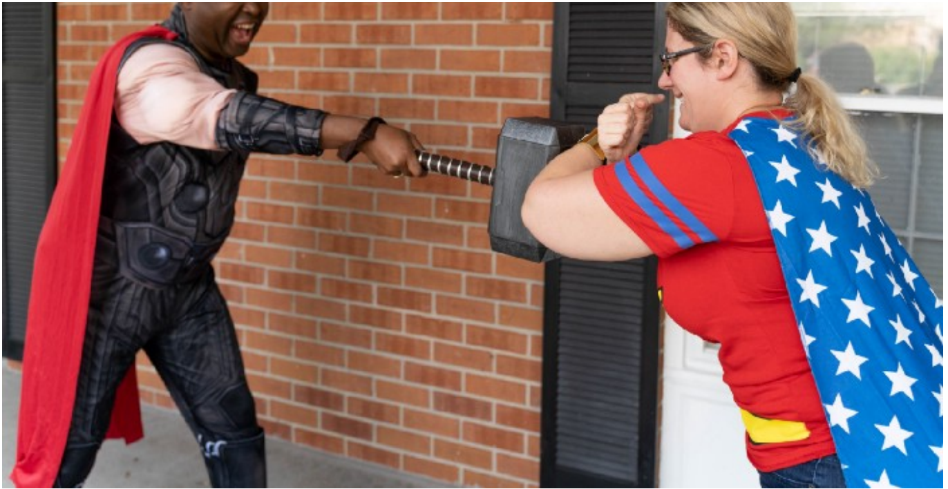
Thor and Wonder Woman aren't showing up, unfortunately — Halloween 2019

So how can we be heroic in the face of peril? For me, I think back to sitting on my living room floor as a kid, taking in every page of my comic books. Superheroes help us find the best in ourselves. Being a superhero, above all else, means being a role model. It means setting an example and inspiring others to be better people, and always doing what is right.